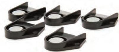
HI920005 Tag holders with tags (5)

Install tags near your sampling points for quick and easy iButton® readings. Each tag contains a computer chip with a unique identification code encased in stainless steel. You can install a practically unlimited amount of tags.